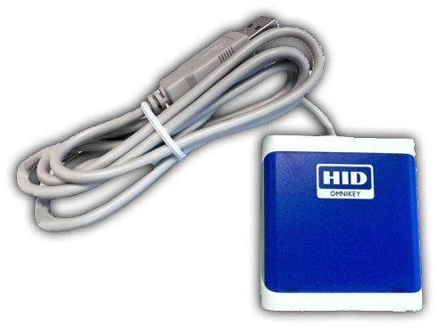
GO NFC Pad Reader